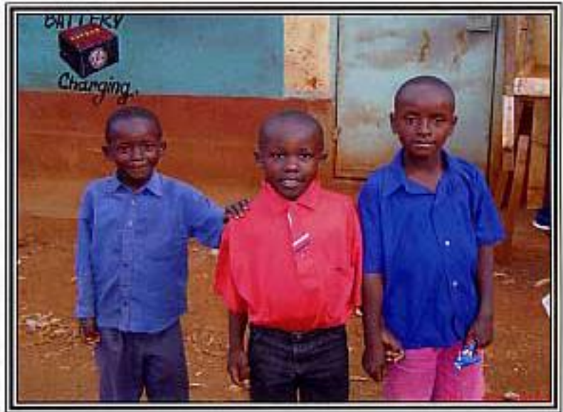
These "Street Boys" are on their own. Who is going to teach them about God, how to read and write, and how to make a living when they grow up? "New Dawn Communities", through your prayers and donations, CAN make a difference in these kids lives.

However, during the first two to three years of establishing the programs and businesses that will eventually provide the self-sustaining resources to make this happen, we need your help. food, clothing, school books and supplies are needed right away