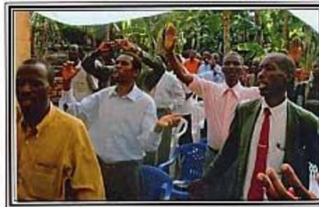
Pastor Conferences, Community Outreach and Home Study Bible Classes are just some of the incredible things that we will be doing in our new facilities. Updates on these and other things that God is doing will be in our next issue.....Keep Praying !!