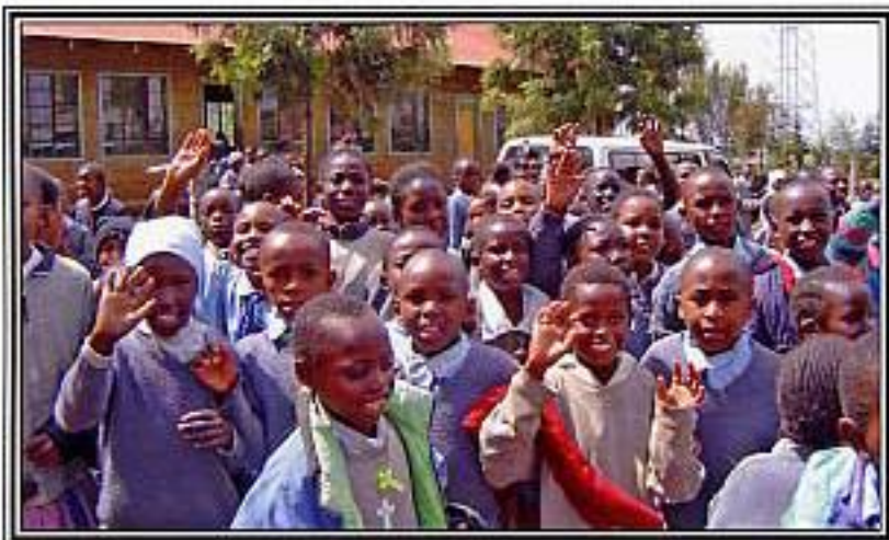
These public school children get their education paid by the Kenyan government through the eighth grade....who is going to help our street orphans?

We know that God will provide and show these young boys and girls that He loves them through your prayerful gifts and support.